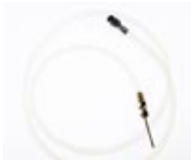
Hose with needle