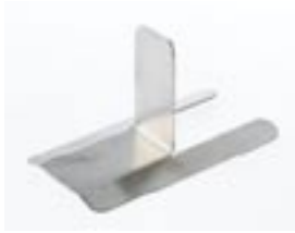
Wedge stainless steel